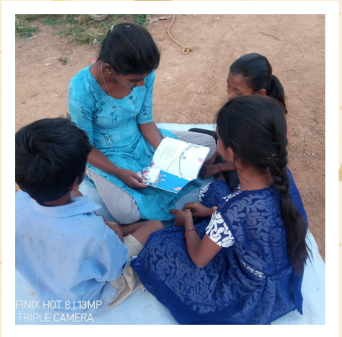
FINIX HOT 8 | 13MP TRIPLE CAMERA