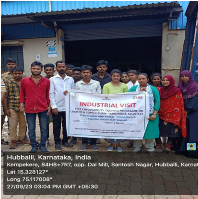
Hubballi, Karnataka, India Kempekere, 84H8+7R7, opp. Dal Mill, Santosh Nagar, Hubballi, Karnat Lat 15.328127° Long 75.117008° 27/09/23 03:04 PM GMT +05:30