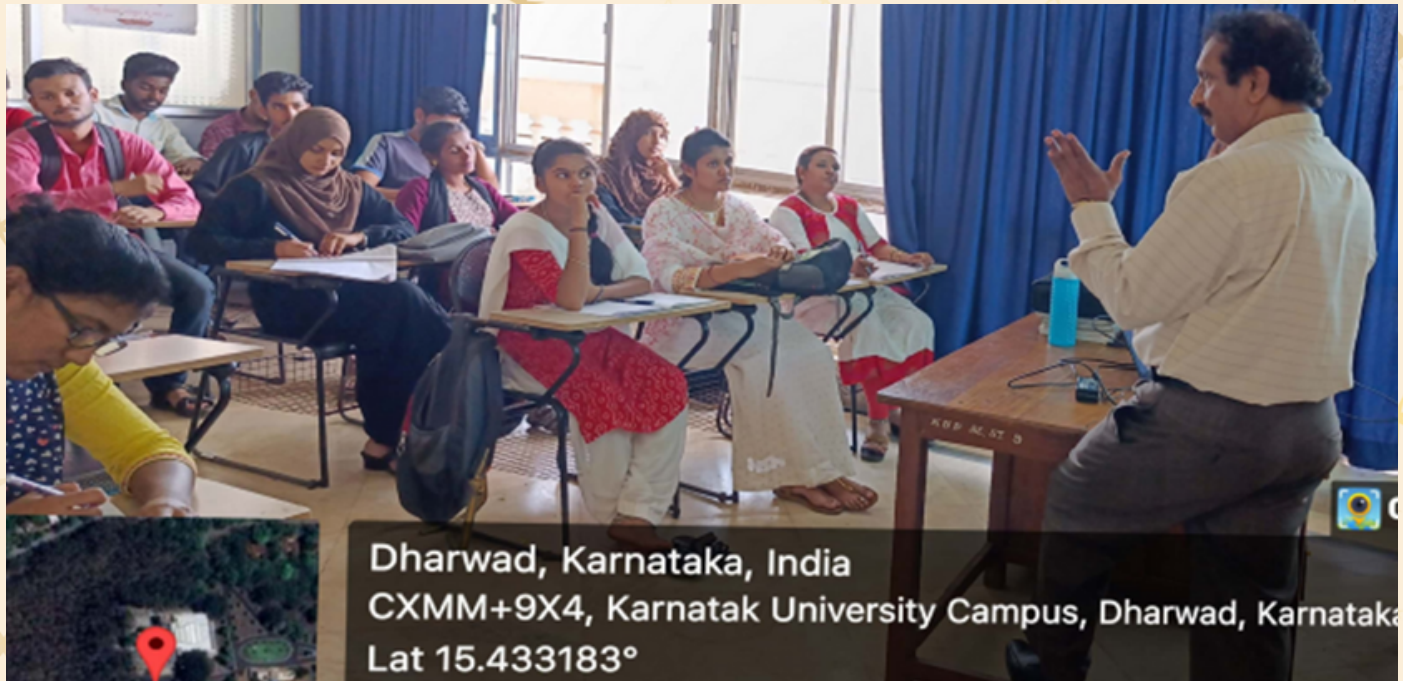
Dharwad, Karnataka, India CXMM+9X4, Karnatak University Campus, Dharwad, Karnataka Lat 15.433183°

Warehouse Associate Training Field visit to TVS SCS WH Bridgestone India Pvt Ltd. and A soft skill training activity based on "Understand the Leader"