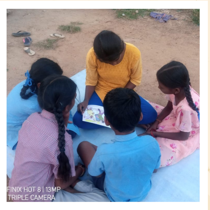
FINIX HOT 8 | 13MP TRIPLE CAMERA