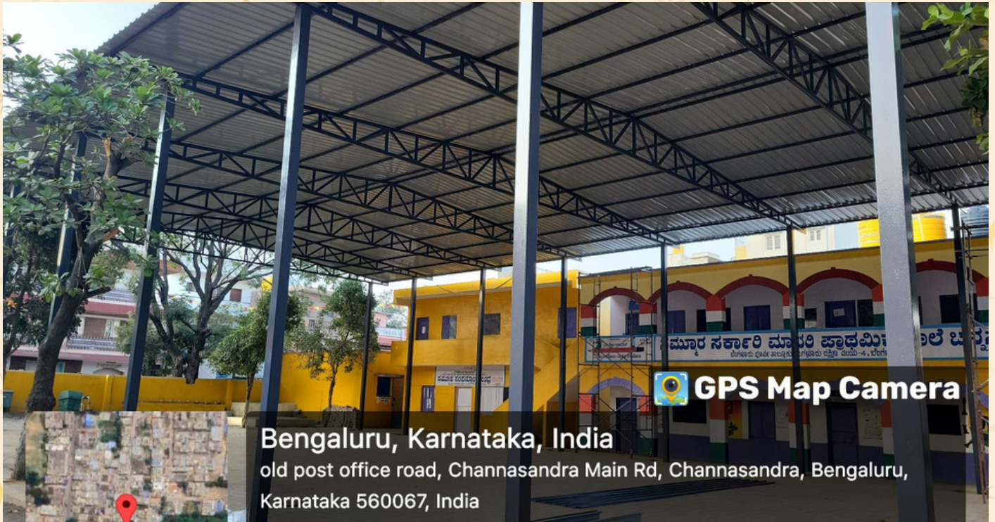
Construction of Auditorium in Government Higher Primary School Channasandra, Bangalore