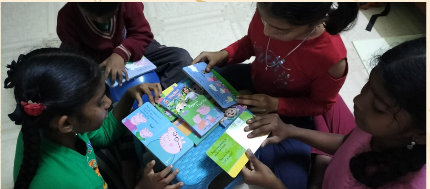
Avasar Reading Captain Our reading captains in action