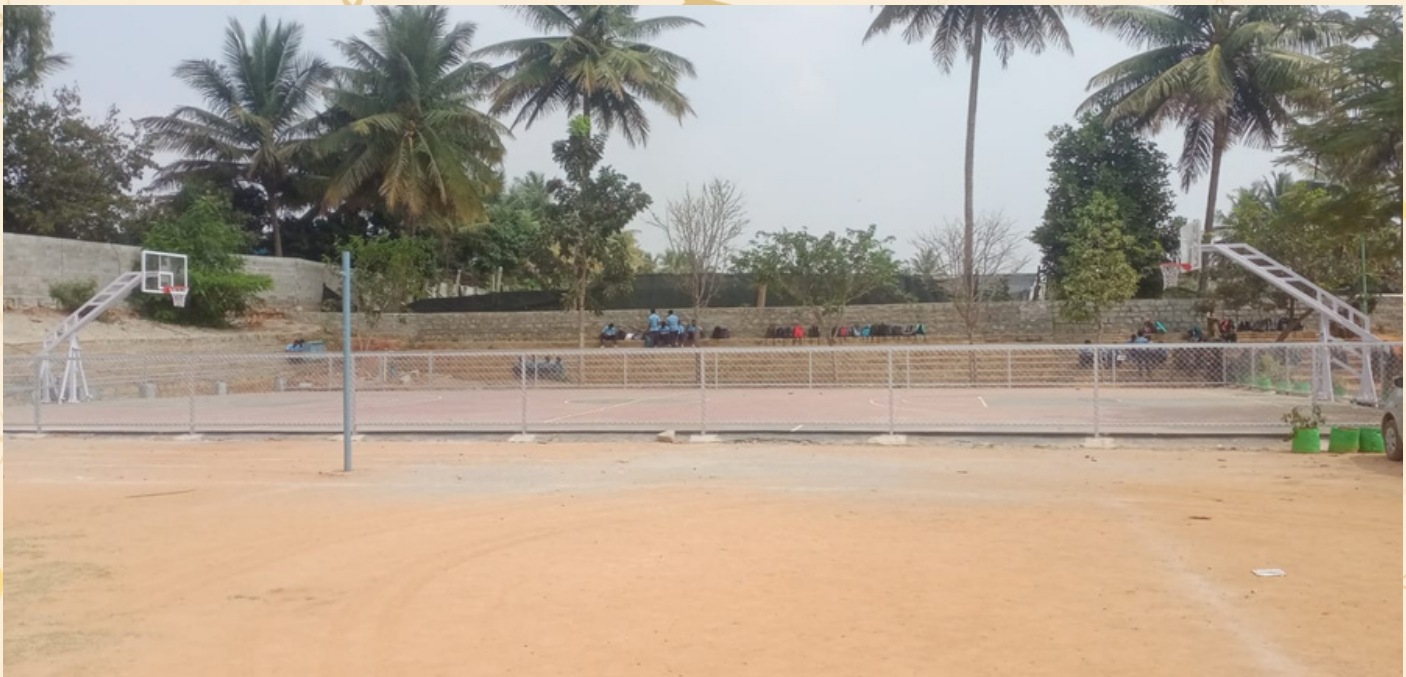
Basket Ball Court- Coming up in Government High School Doddabanahalli, Bangalore