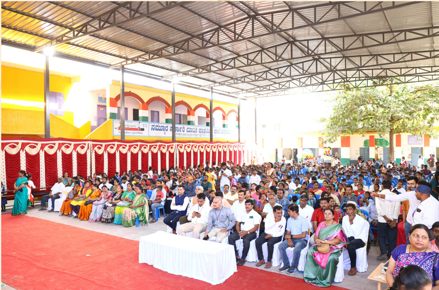
Inaugurated "Varakavi D R Bendre Auditorium" of 500 seating capacity, at Government Model Higher Primary School, Channasandra, Bangalore.